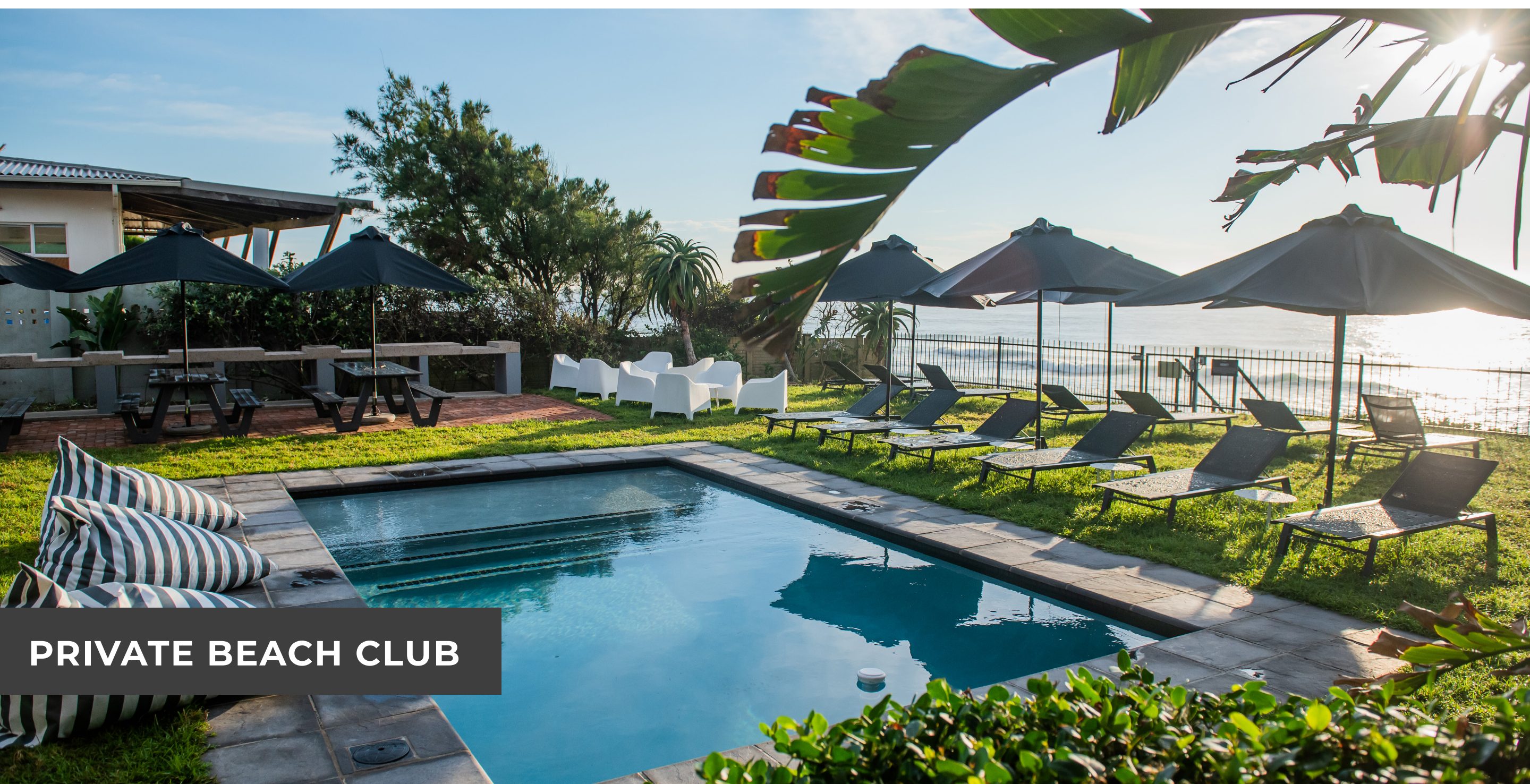
PRIVATE BEACH CLUB